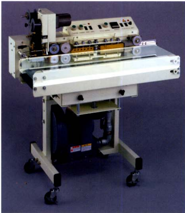
4 Model BD+7PS with(Hot Printer + Air Evacuation Device) Conveyor moves below 50mm for adjustment.